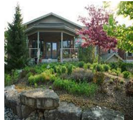
Guelph Wellington Hospice

A visit to a charming cottage garden in an older part of Guelph will showcase a large variety of plants. This informal style of garden changes every few weeks during the season.