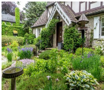
Private Garden