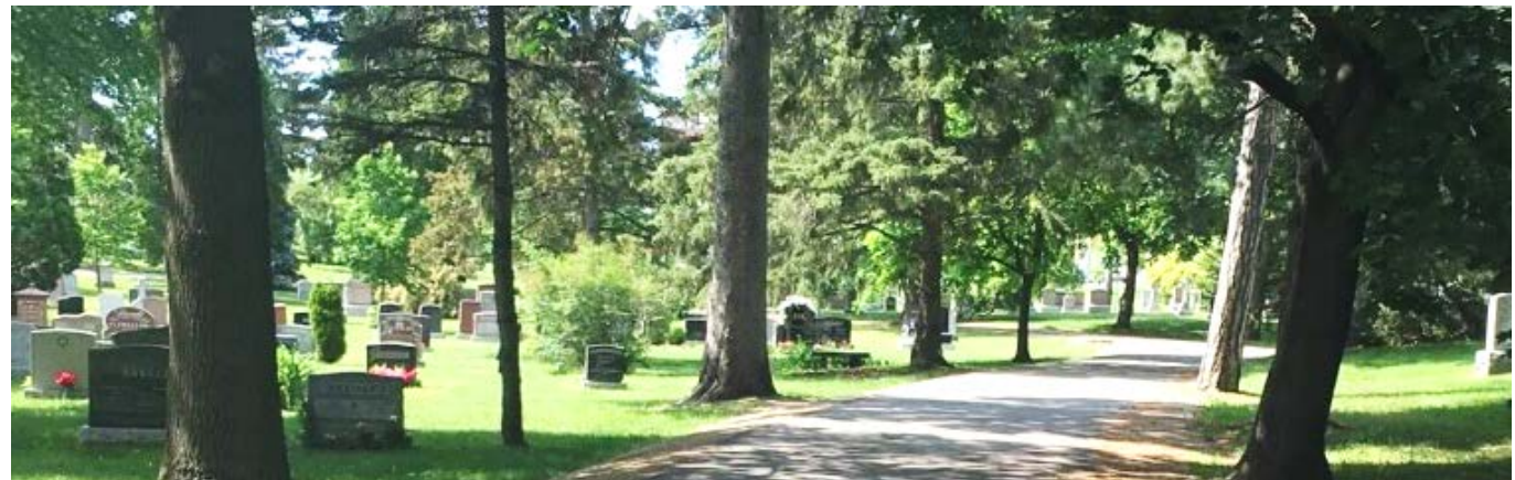
Woodlawn Cemetery

We will then cross the road to Woodlawn Cemetery – 80 acres of some of the oldest trees in Guelph with walking trails. A tour to point out some of the magnificent trees of this park will be given and then you may wander until time to catch the bus to return to the hotel.