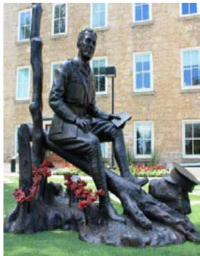
John McCrae statue

John McCrae House