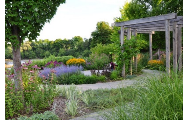
Enabling Gardens - Courtesy of City of Guelph Website

You will then be directed to the Guelph Floral Clock – a 28' diameter filled with up to six thousand plants and replanted each year. This year's theme is "We are All Treaty People" Many surrounding gardens accompany this amazing floral clock.