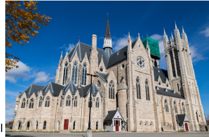
Basilica of our Lady Immaculate

A visit to the statue of John McCrae at the Basilica of our Lady Immaculate will follow – giving a grand view of the City of Guelph.