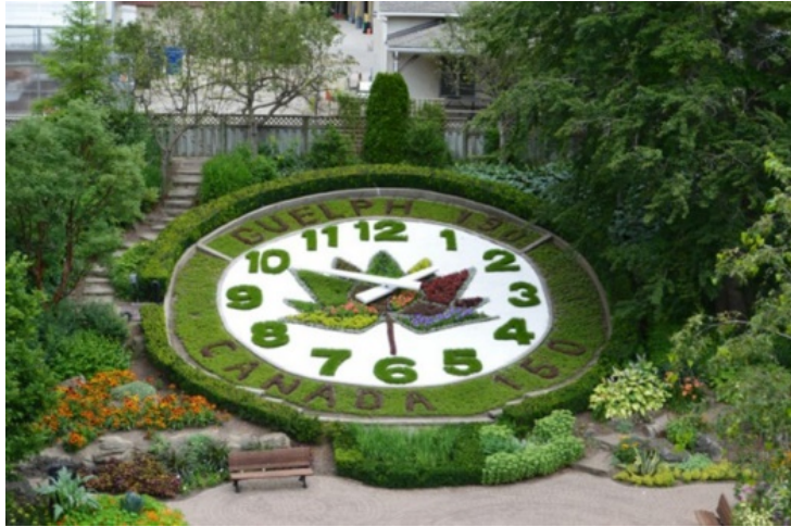
Guelph Floral Clock